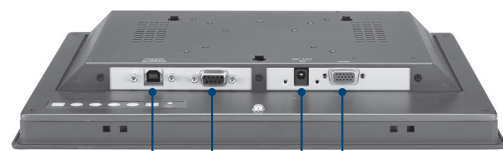
Touchscreen (USB) VGA Port Touchscreen (RS-232) DC Jack 12V dc (100 ~ 240V AC adapter included)